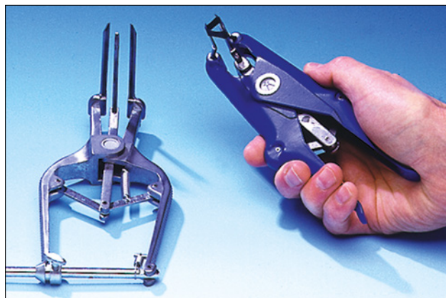
Fast, secure application with the three-pronged expansion tools.