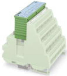
Replacement module electronics for IB ST (ZF) 24 DI 32/2

Please be informed that the data shown in this PDF Document is generated from our Online Catalog. Please find the complete data in the user's documentation. Our General Terms of Use for Downloads are valid ( http://download.phoenixcontact.com )