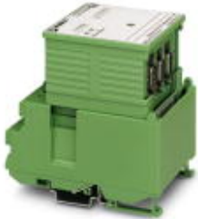
Replacement module electronics for IBS ST (ZF) 24 BK RB-T

Please be informed that the data shown in this PDF Document is generated from our Online Catalog. Please find the complete data in the user's documentation. Our General Terms of Use for Downloads are valid ( http://download.phoenixcontact.com )