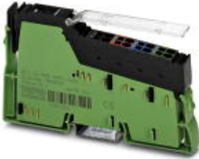
Inline boost terminal for the communications power U_L of 0.8 A, complete with accessories (connectors and labeling field)

Please be informed that the data shown in this PDF Document is generated from our Online Catalog. Please find the complete data in the user's documentation. Our General Terms of Use for Downloads are valid ( http://download.phoenixcontact.com )