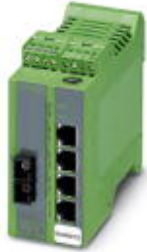
Ethernet Lean Managed Switch with four 10/100 Mbps RJ45 ports and one 10/100 Mbps FX-SC multi-mode port

Please be informed that the data shown in this PDF Document is generated from our Online Catalog. Please find the complete data in the user's documentation. Our General Terms of Use for Downloads are valid ( http://download.phoenixcontact.com )