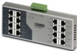
Ethernet Switch, 16 TP RJ45 ports, automatic detection of data transmission speed of 10 or 100 Mbps (RJ45), autocrossing function

Please be informed that the data shown in this PDF Document is generated from our Online Catalog. Please find the complete data in the user's documentation. Our General Terms of Use for Downloads are valid ( http://download.phoenixcontact.com )