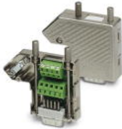
D-SUB connector, 9-pos., male connector, one cable entry < 35°, universal type for all systems, pin assignment: 1, 2, 3, 4, 5, 6, 7, 8, 9 to screw connection terminal block

Please be informed that the data shown in this PDF Document is generated from our Online Catalog. Please find the complete data in the user's documentation. Our General Terms of Use for Downloads are valid ( http://download.phoenixcontact.com )