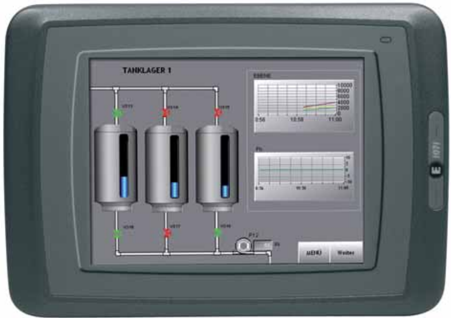
Touch-Screen terminal, tough Aluminium casing - stands up to the industrial work place

A USB host is available allowing you to add standard PC peripherals such as keyboard, mouse, printers and USB memory to your local E1000 operator terminal (not for E1012 and 1022).