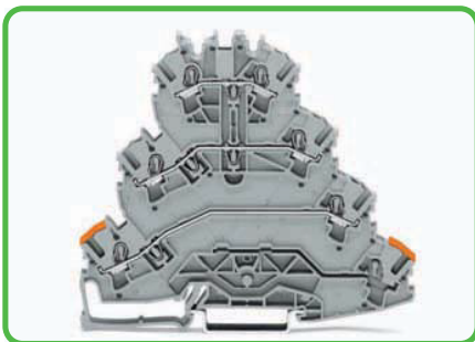
Lockout cap for conductor entry hole and operating slot

Clearly designated clamping units is the primary advantage to this terminal block design. When using devices with protective insulation for example, there are no open ground clamping units that could create confusion.