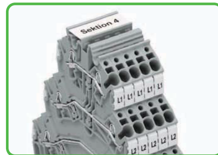
Marking clamping units with WMB Multi marking system (see Section 13).

3 phases and ground conductor in one terminal block.