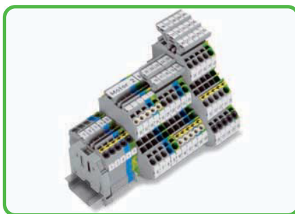
Combination of multilevel terminal blocks