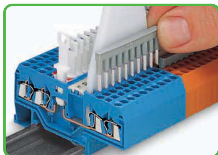
Disconnect terminal blocks for test and measurement 10-way, comb-style jumper bar