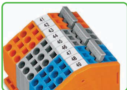
4-conductor through terminal blocks, angled type Formation of groups with 3-way, comb-style jumper bars