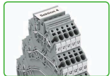
Marking clamping units with WMB Multi marking system (see Section 13).

3 phases and ground conductor in one terminal block.