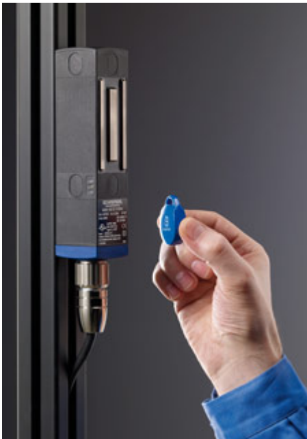
Product in the environment

K.A. Schmersal GmbH & Co. KG, Möddinghofe 30, D-42279 Wuppertal