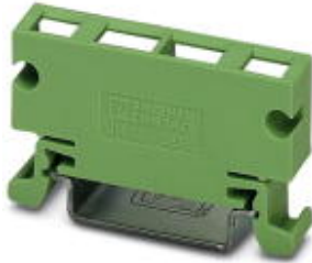
Side element with foot, however without PCB guide, labeling with SS-ZB, mounted along the length of the DIN rail NS 35/7.5. Height: 36 mm, width: 10 mm, length: 45 mm.

Please be informed that the data shown in this PDF Document is generated from our Online Catalog. Please find the complete data in the user's documentation. Our General Terms of Use for Downloads are valid ( http://download.phoenixcontact.com )