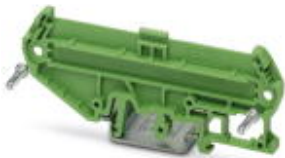
Side element, right, with foot, width: 5 mm, width: 72 mm, for mounting on NS 32 or NS 35/7.5

Please be informed that the data shown in this PDF Document is generated from our Online Catalog. Please find the complete data in the user's documentation. Our General Terms of Use for Downloads are valid ( http://download.phoenixcontact.com )