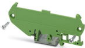
Side element, left, with foot, width: 5 mm, length: 72 mm, for mounting on NS 32 or NS 35/7.5

Please be informed that the data shown in this PDF Document is generated from our Online Catalog. Please find the complete data in the user's documentation. Our General Terms of Use for Downloads are valid ( http://download.phoenixcontact.com )