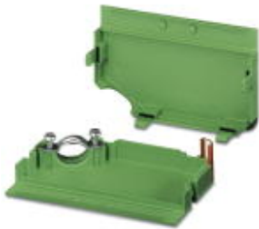
Cable housing, Pitch: 0 mm, Number of positions: 10, Dimension a: 50 mm, Color: green

Please be informed that the data shown in this PDF Document is generated from our Online Catalog. Please find the complete data in the user's documentation. Our General Terms of Use for Downloads are valid ( http://download.phoenixcontact.com )