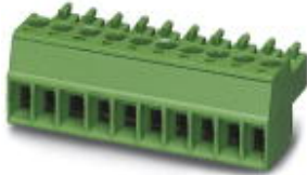
Plug component, Nominal current: 8 A, Rated voltage (III/2): 160 V, Number of positions: 16, Pitch: 3.81 mm, Connection method: Screw connection, Color: green, Contact surface: Tin

Please be informed that the data shown in this PDF Document is generated from our Online Catalog. Please find the complete data in the user's documentation. Our General Terms of Use for Downloads are valid ( http://download.phoenixcontact.com )