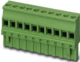
Plug component, Nominal current: 12 A, Rated voltage (III/2): 320 V, Number of positions: 10, Pitch: 5.08 mm, Connection method: Screw connection, Color: green, Contact surface: Tin

Please be informed that the data shown in this PDF Document is generated from our Online Catalog. Please find the complete data in the user's documentation. Our General Terms of Use for Downloads are valid ( http://download.phoenixcontact.com )