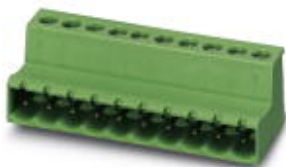
Plug component, Nominal current: 12 A, Rated voltage (III/2): 320 V, Number of positions: 5, Pitch: 5.08 mm, Connection method: Screw connection, Color: green, Contact surface: Tin

Please be informed that the data shown in this PDF Document is generated from our Online Catalog. Please find the complete data in the user's documentation. Our General Terms of Use for Downloads are valid ( http://download.phoenixcontact.com )