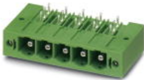
Header, Nominal current: 76 A, Rated voltage (III/2): 1000 V, Number of positions: 3, Pitch: 10.16 mm, Color: green, Contact surface: Silver, Assembly: Soldering

Please be informed that the data shown in this PDF Document is generated from our Online Catalog. Please find the complete data in the user's documentation. Our General Terms of Use for Downloads are valid ( http://download.phoenixcontact.com )