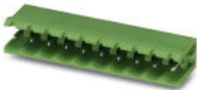
Header, Nominal current: 12 A, Rated voltage (III/2): 320 V, Number of positions: 6, Pitch: 5.08 mm, Color: green, Contact surface: Tin, Assembly: Soldering

Please be informed that the data shown in this PDF Document is generated from our Online Catalog. Please find the complete data in the user's documentation. Our General Terms of Use for Downloads are valid ( http://download.phoenixcontact.com )