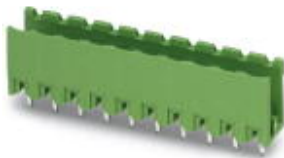
Header, Nominal current: 12 A, Rated voltage (III/2): 320 V, Number of positions: 2, Pitch: 5.08 mm, Color: green, Contact surface: Tin, Assembly: Soldering

Please be informed that the data shown in this PDF Document is generated from our Online Catalog. Please find the complete data in the user's documentation. Our General Terms of Use for Downloads are valid ( http://download.phoenixcontact.com )