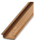
DIN rail, material: Copper, unperforated, height 7.5 mm, width 35 mm, length: 2 m

DIN rail, unperforated - NS 35/ 7,5 CU UNPERF 2000MM - 0801762