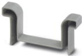
DIN rail end piece, for DIN rail NS 35/15

Please be informed that the data shown in this PDF Document is generated from our Online Catalog. Please find the complete data in the user's documentation. Our General Terms of Use for Downloads are valid ( http://download.phoenixcontact.com )