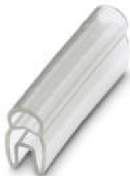
The illustration shows version PATG 0/15

Conductor marker carrier, transparent, Unlabeled, Mounting type: Slide on, Cable diameter: 1.5-2.5 mm, Lettering field: 4 x 23 mm