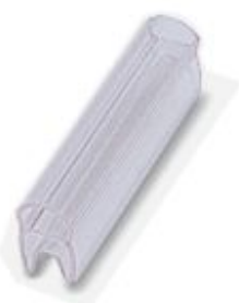
Conductor marker carrier, transparent, Unlabeled, Mounting type: Slide on, Cable diameter: 2-4 mm, Lettering field: 4 x 15 mm

Please be informed that the data shown in this PDF Document is generated from our Online Catalog. Please find the complete data in the user's documentation. Our General Terms of Use for Downloads are valid ( http://download.phoenixcontact.com )