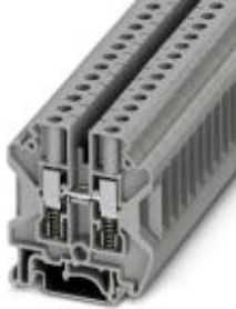
Feed-through terminal block, Connection method: Screw connection with spring support, Cross section: 0.2 mm 2 - 10 mm 2 , AWG: 24 - 8, Width: 8.2 mm, Color: gray, Mounting type: NS 35/7,5, NS 35/15, NS 32

Please be informed that the data shown in this PDF Document is generated from our Online Catalog. Please find the complete data in the user's documentation. Our General Terms of Use for Downloads are valid ( http://download.phoenixcontact.com )