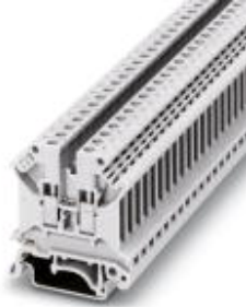
Feed-through terminal block, Connection method: Screw connection, Cross section: 0.2 mm 2 - 6 mm 2 , AWG: 24 - 10, Width: 6.2 mm, Color: white, Mounting type: NS 35/7,5, NS 35/15, NS 32

Please be informed that the data shown in this PDF Document is generated from our Online Catalog. Please find the complete data in the user's documentation. Our General Terms of Use for Downloads are valid ( http://download.phoenixcontact.com )