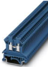
Feed-through terminal block, Connection method: Screw connection, Cross section: 0.2 mm 2 - 4 mm 2 , AWG: 24 - 12, Width: 5.2 mm, Color: blue, Mounting type: NS 35/7,5, NS 35/15

Please be informed that the data shown in this PDF Document is generated from our Online Catalog. Please find the complete data in the user's documentation. Our General Terms of Use for Downloads are valid ( http://download.phoenixcontact.com )