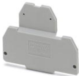
End cover, Length: 44 mm, Width: 1 mm, Color: gray

Please be informed that the data shown in this PDF Document is generated from our Online Catalog. Please find the complete data in the user's documentation. Our General Terms of Use for Downloads are valid ( http://download.phoenixcontact.com )