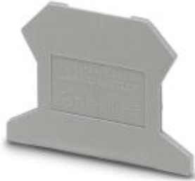
End cover, Length: 42.5 mm, Width: 1.5 mm, Height: 30.7 mm, Color: gray

Please be informed that the data shown in this PDF Document is generated from our Online Catalog. Please find the complete data in the user's documentation. Our General Terms of Use for Downloads are valid ( http://download.phoenixcontact.com )