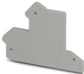
End cover, Length: 56.7 mm, Width: 2.5 mm, Height: 52.3 mm, Number of positions: 1, Color: gray

Please be informed that the data shown in this PDF Document is generated from our Online Catalog. Please find the complete data in the user's documentation. Our General Terms of Use for Downloads are valid ( http://download.phoenixcontact.com )