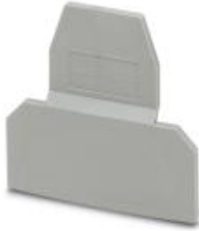
End cover, Length: 56 mm, Width: 2.2 mm, Height: 52 mm, Color: gray

Please be informed that the data shown in this PDF Document is generated from our Online Catalog. Please find the complete data in the user's documentation. Our General Terms of Use for Downloads are valid ( http://download.phoenixcontact.com )