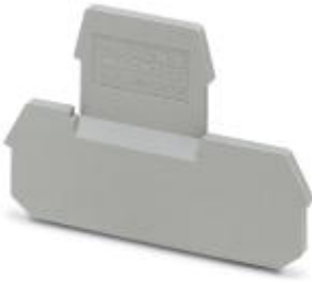
End cover, Length: 62 mm, Width: 2.5 mm, Color: gray

Please be informed that the data shown in this PDF Document is generated from our Online Catalog. Please find the complete data in the user's documentation. Our General Terms of Use for Downloads are valid ( http://download.phoenixcontact.com )