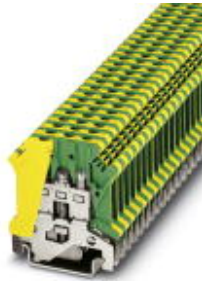
Ground modular terminal block, Connection method: Screw connection, Cross section: 0.2 mm 2 - 4 mm 2 , AWG: 24 - 12, Width: 6.2 mm, Color: green-yellow, Mounting type: NS 35/7,5, NS 35/15, NS 32

Please be informed that the data shown in this PDF Document is generated from our Online Catalog. Please find the complete data in the user's documentation. Our General Terms of Use for Downloads are valid ( http://download.phoenixcontact.com )