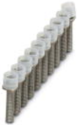
Jumper, Number of positions: 10, Color: silver

Please be informed that the data shown in this PDF Document is generated from our Online Catalog. Please find the complete data in the user's documentation. Our General Terms of Use for Downloads are valid ( http://phoenixcontact.com/download )