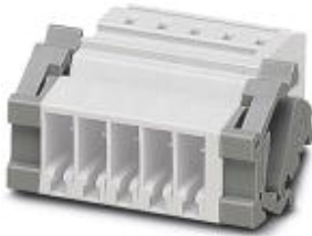
Panel feed-through, Width: 5.2 mm, Color: gray

Please be informed that the data shown in this PDF Document is generated from our Online Catalog. Please find the complete data in the user's documentation. Our General Terms of Use for Downloads are valid ( http://download.phoenixcontact.com )