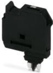
Fuse plug, Nominal current: 6.3 A, Length: 28 mm, Width: 6.2 mm, Height: 25 mm, Color: black

Please be informed that the data shown in this PDF Document is generated from our Online Catalog. Please find the complete data in the user's documentation. Our General Terms of Use for Downloads are valid ( http://download.phoenixcontact.com )