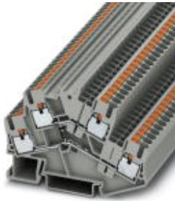
Component terminal block, Connection method: Push-in connection, Cross section: 0.14 mm 2 - 4 mm 2 , AWG: 26 - 12, Width: 5.2 mm, Color: gray, Mounting type: NS 35/7,5, NS 35/15

Please be informed that the data shown in this PDF Document is generated from our Online Catalog. Please find the complete data in the user's documentation. Our General Terms of Use for Downloads are valid ( http://download.phoenixcontact.com )