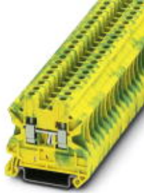
Ground modular terminal block, Connection method: Screw connection, Cross section: 0.14 mm 2 - 6 mm 2 , AWG: 26 - 10, Width: 6.2 mm, Color: green-yellow, Mounting type: NS 35/7,5, NS 35/15

Please be informed that the data shown in this PDF Document is generated from our Online Catalog. Please find the complete data in the user's documentation. Our General Terms of Use for Downloads are valid ( http://download.phoenixcontact.com )