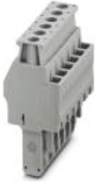
Plug, Connection method: Screw connection, Number of positions: 3, Cross section: 0.14 mm 2 - 6 mm 2 , AWG: 26 - 10, Width: 18.6 mm, Height: 48.5 mm, Color: gray

Please be informed that the data shown in this PDF Document is generated from our Online Catalog. Please find the complete data in the user's documentation. Our General Terms of Use for Downloads are valid ( http://download.phoenixcontact.com )