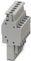
Plug, Connection method: Screw connection, Number of positions: 1, Cross section: 0.14 mm 2 - 4 mm 2 , AWG: 26 - 12, Width: 5.2 mm, Height: 47 mm, Color: green-yellow

Please be informed that the data shown in this PDF Document is generated from our Online Catalog. Please find the complete data in the user's documentation. Our General Terms of Use for Downloads are valid ( http://download.phoenixcontact.com )