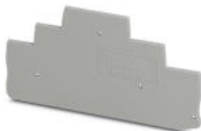
End cover, Length: 102.2 mm, Width: 2.2 mm, Height: 50.2 mm, Color: gray

Please be informed that the data shown in this PDF Document is generated from our Online Catalog. Please find the complete data in the user's documentation. Our General Terms of Use for Downloads are valid ( http://download.phoenixcontact.com )