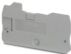
End cover, Length: 62.6 mm, Width: 2.2 mm, Color: gray

Please be informed that the data shown in this PDF Document is generated from our Online Catalog. Please find the complete data in the user's documentation. Our General Terms of Use for Downloads are valid ( http://download.phoenixcontact.com )