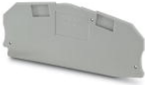
End cover, Length: 100.8 mm, Width: 2.2 mm, Height: 49.6 mm, Color: gray

Please be informed that the data shown in this PDF Document is generated from our Online Catalog. Please find the complete data in the user's documentation. Our General Terms of Use for Downloads are valid ( http://download.phoenixcontact.com )