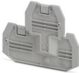
End cover, Length: 69.9 mm, Width: 2.2 mm, Height: 57.5 mm, Color: gray

Please be informed that the data shown in this PDF Document is generated from our Online Catalog. Please find the complete data in the user's documentation. Our General Terms of Use for Downloads are valid ( http://download.phoenixcontact.com )