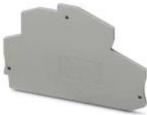
End cover, Length: 78 mm, Width: 2.2 mm, Height: 54.5 mm, Color: gray

Please be informed that the data shown in this PDF Document is generated from our Online Catalog. Please find the complete data in the user's documentation. Our General Terms of Use for Downloads are valid ( http://download.phoenixcontact.com )