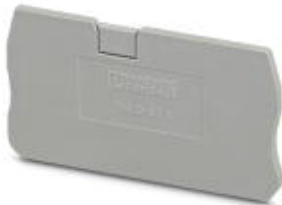
End cover, Length: 55.9 mm, Width: 2.2 mm, Height: 29 mm, Color: gray

Please be informed that the data shown in this PDF Document is generated from our Online Catalog. Please find the complete data in the user's documentation. Our General Terms of Use for Downloads are valid ( http://download.phoenixcontact.com )