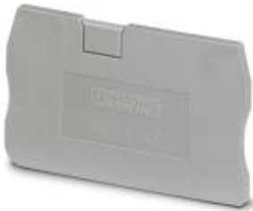
End cover, Length: 48.6 mm, Width: 2.2 mm, Height: 29.1 mm, Color: gray

Please be informed that the data shown in this PDF Document is generated from our Online Catalog. Please find the complete data in the user's documentation. Our General Terms of Use for Downloads are valid ( http://download.phoenixcontact.com )